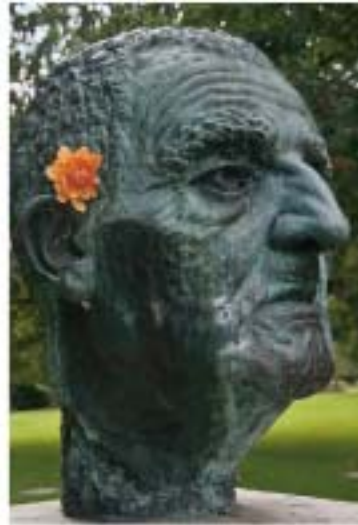
Anton Bruckner 1855 – 1868

Wrote literature which focuses on both the human being and nature, and invites one to take life at a more leisurely pace.