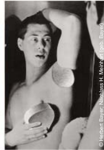
Herbert Bayer 1900 – 1985

With her media art, films and performances, the artist raises important questions about society.