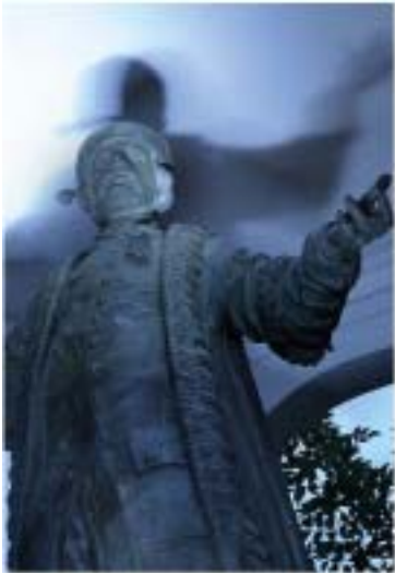
Johannes Kepler 1571 – 1630

Researched the orbits of the solar system in Linz and changed the accepted views of the world with his observations.