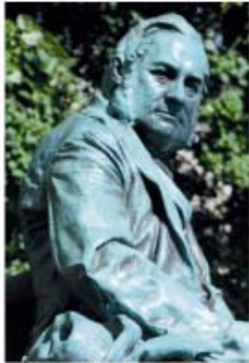
Adalbert Stifter 1848 – 1868

Researched the orbits of the solar system in Linz and changed the accepted views of the world with his observations.