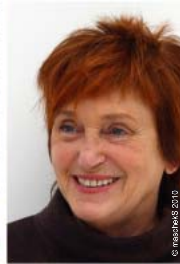
Valie Export *1940 in Linz

Revolutionised the world of music with his anticipation of film montage techniques (cutting and fading), and his divine symphonies.